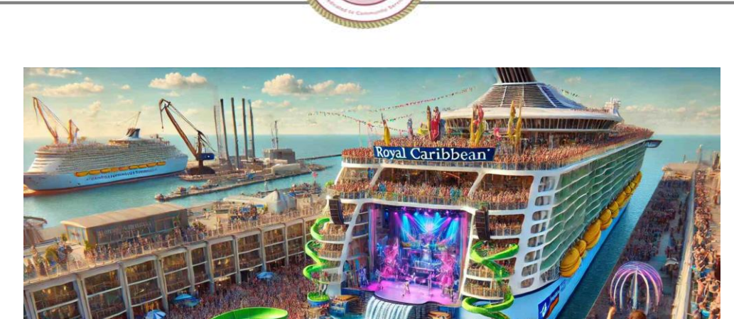
Cruise Fundraising Update

Our two Men's Club Cruises for 2024 were very successful. Fifty members and friends sailed on the Royal Caribbean Utopia in September, and Sixty sailed on the Celebrity Apex in November. These cruises are fundraisers due to our partnership with Travelworld, who will be on hand at our Ladies Luncheon in December to deliver a check for the funds we raised this past year. The Club has earned approximately $60 thousand dollars over the past 12 years with our cruises with all these funds going back to the community via our sponsorships. It's great to have a good time cruising while raising money to help support Lifeline and many other worthy local causes. Stay tuned to the Chronicle to see what cruises are planned for 2025