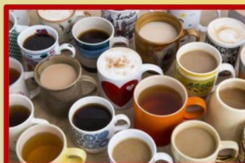
Decaf Coffee, Iced Tea and Sodas