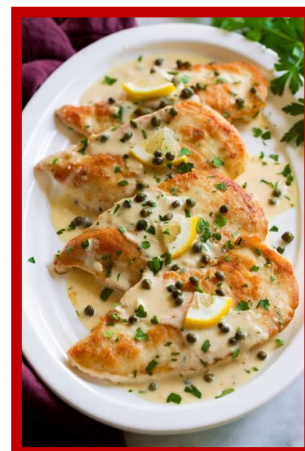
B r e a s t o f C h i c k e n