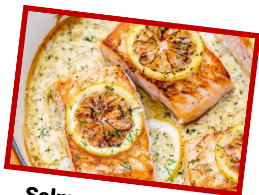
Salmon with Sauce