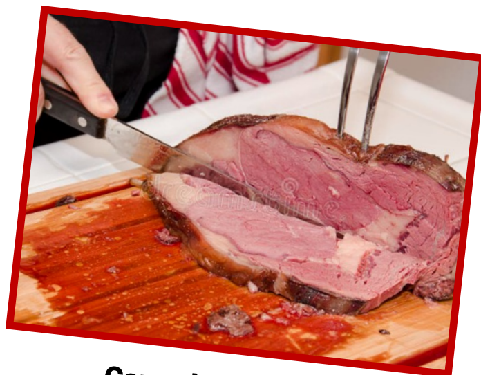
Carved Prime Rib