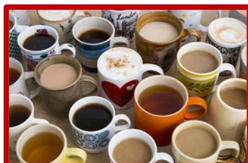
Decaf Coffee, Iced Tea and Sodas