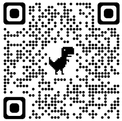
QR Code for the Main Page