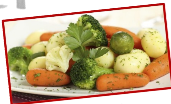
Chef selected side dishes/vegetables