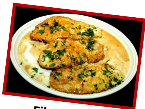
Filet of Sole